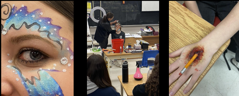
Special Effects Makeup Certificate 2022/23

SHSM STUDENTS SHOULD CROSS CHECK the SHSM PATHWAY CHARTS in February to ensure they request SHSM eligible courses